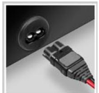
1-1/2" Round Hole Adaptor Included